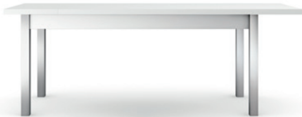
TAVOLO FISSO, PIANO SP. 4 CM FIXED TABLE, TOP THK. 4 CM